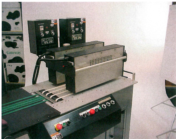
Using dual KR 881 systems means drying two separate ink patterns or one pattern over 8" wide.

Who wants to spend a fortune on a drying system? After all, investing in an inkjet printing system isn't cheap. Now you have a choice. The KR 881 Heat Mate is the economical solution the mailing industry is turning to for drying water and solvent based inks. Energy efficient and a cost effective design combine to make the KR 881 one red-hot bargain . Lower operating costs and faster line speeds means the KR 881 helps you get more value out of your existing inkjet system. Invest in your future and build your fortune (not spend one) with Kirk-Rudy equipment. Increase the value of your operation (as well as your fortune) by investing in the KR 881...your single source mailing equipment supplier.